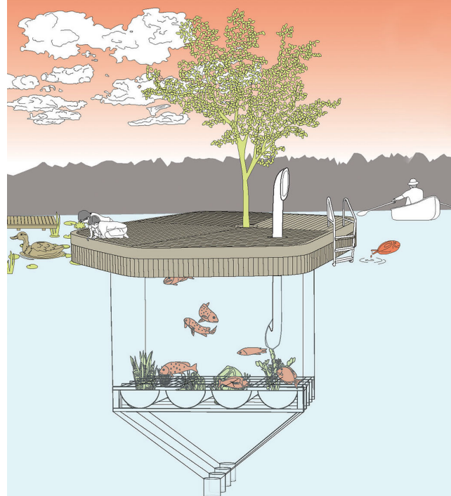
Where the Street Ends, internship graphics, 2023